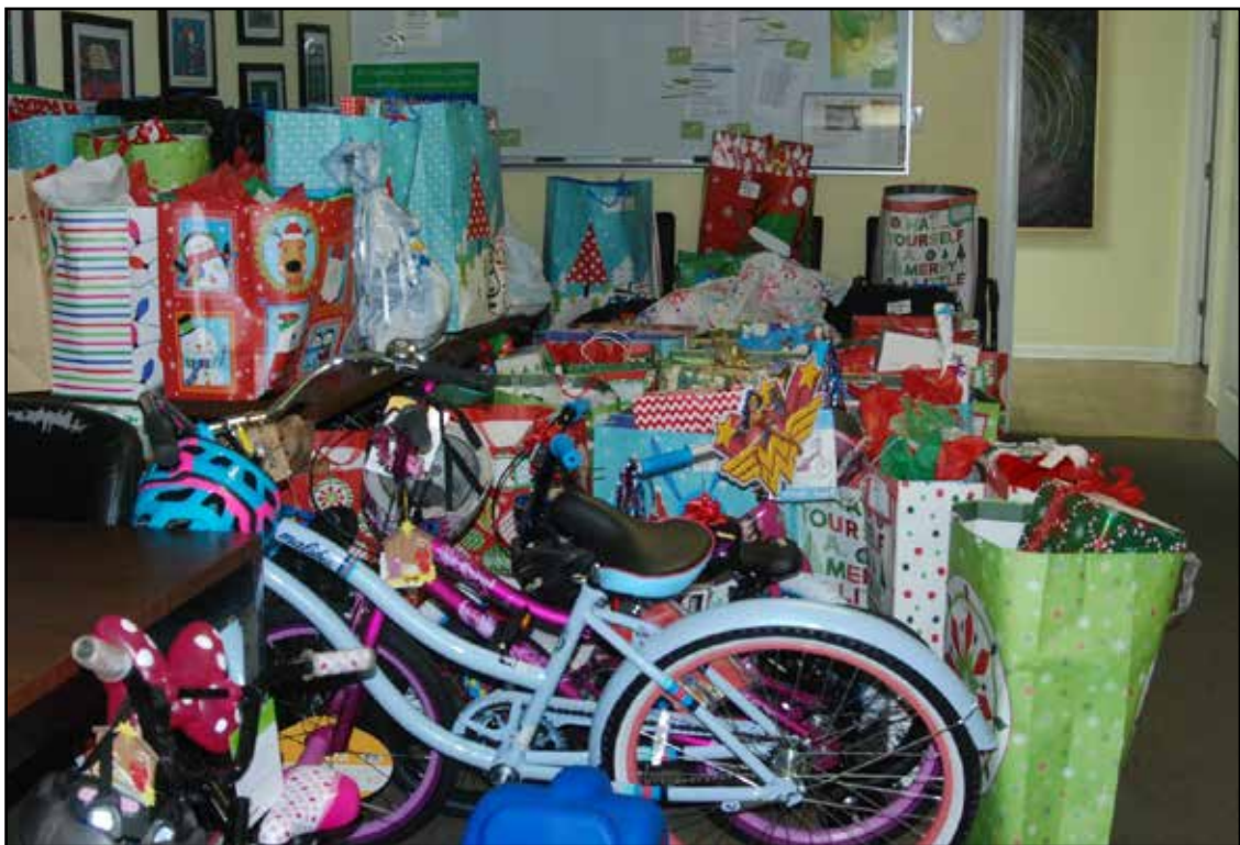
Christmas gifts collected from St. Aloysius and two other congregations as part of the annual Giving Tree campaign.