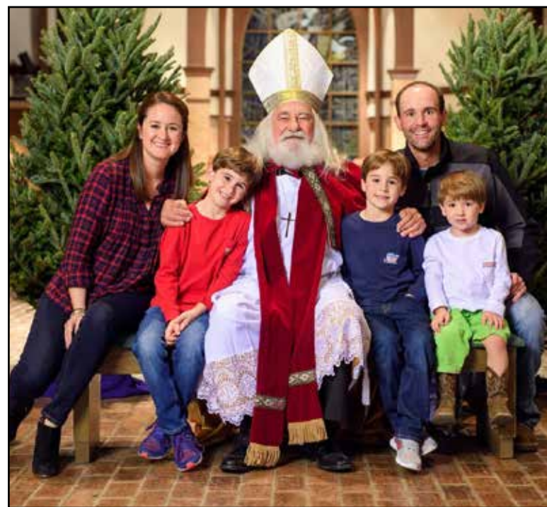
Eye Wander Photography