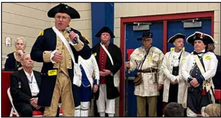
Members of the General Philemon Thomas Chapter at SAS morning assembly.