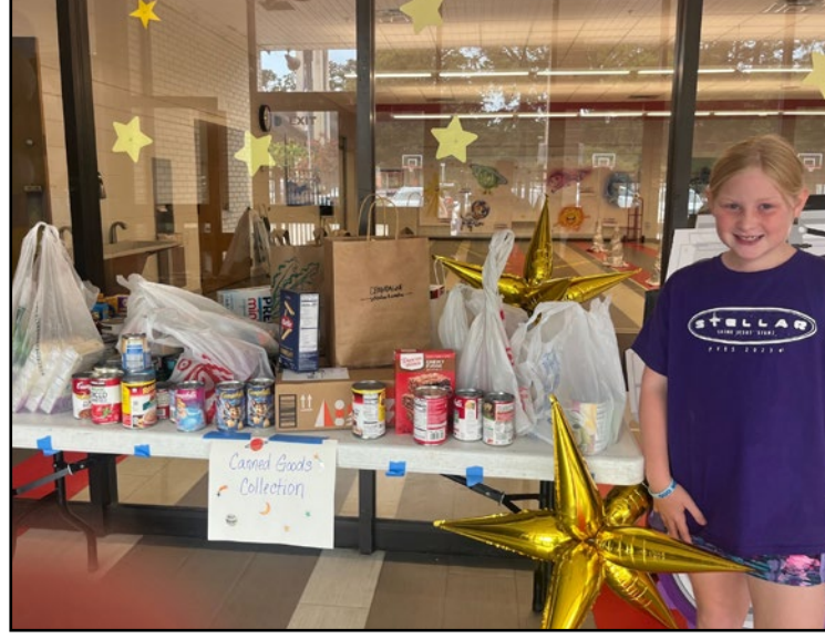
Page 4, September, 2023, ALOYSIUS ALIVE