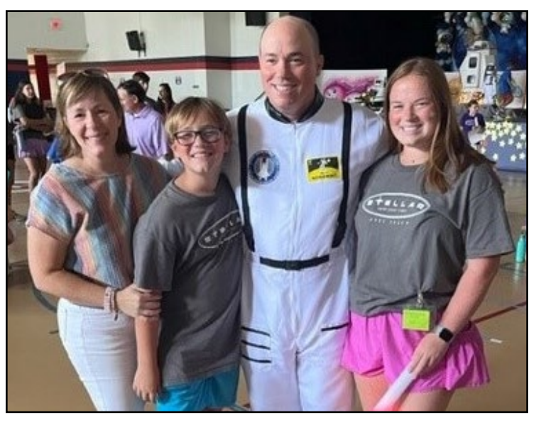
September, 2023, ALOYSIUS ALIVE, Page 5