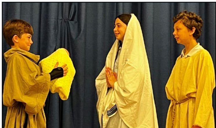
Tableau of the Presentation of Jesus in the Temple